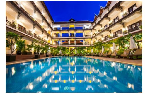
Saem Siem Reap Hotel