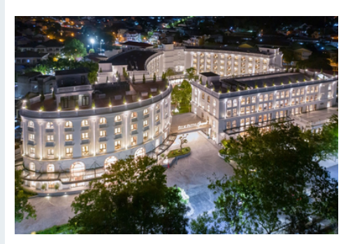
Silk Path Grand Hue Hotel