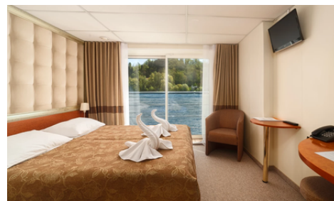
Upper Deck Deluxe Cabin with French Balcony